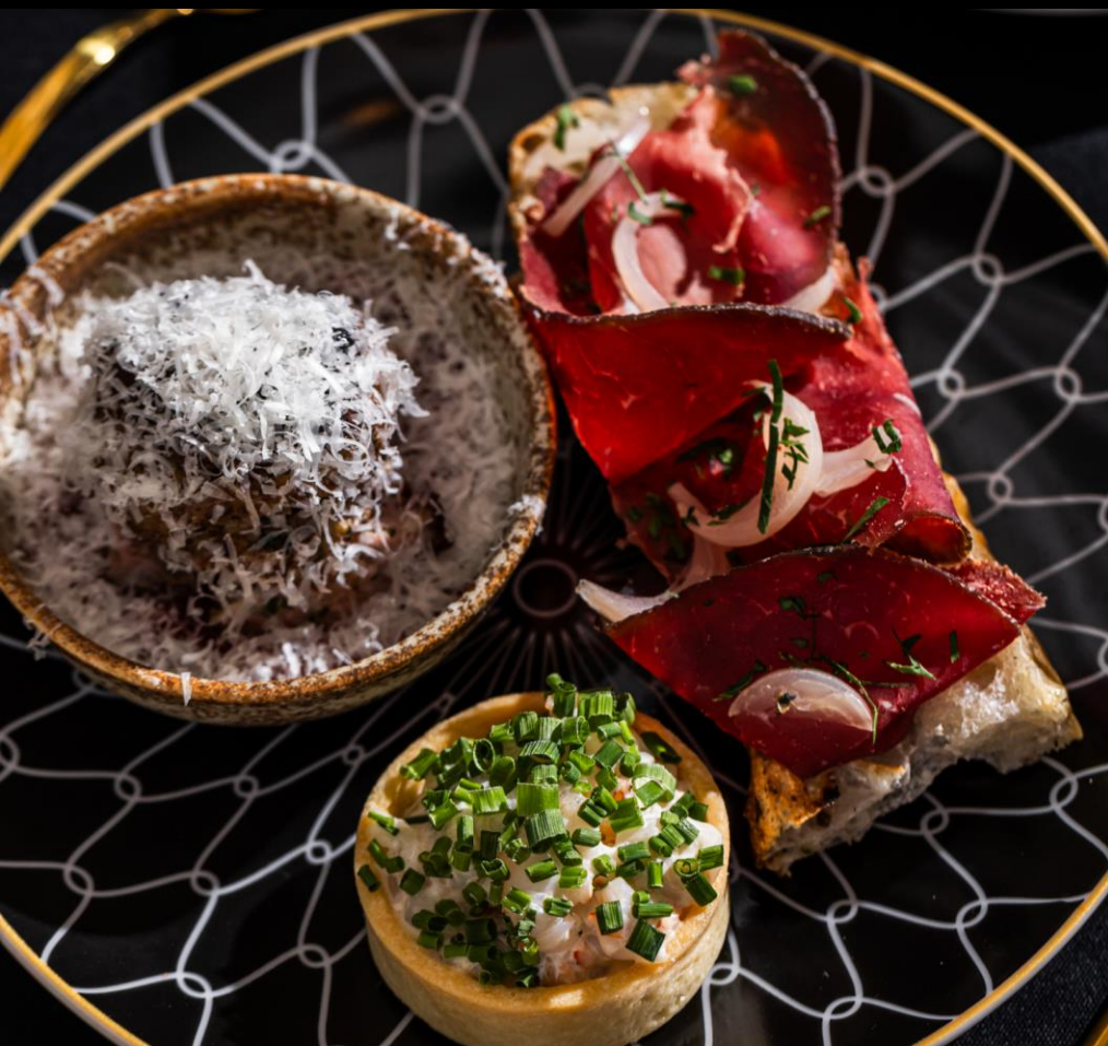
Products subject to change due to availability. Please note a surcharge fee of 10% applies on Sundays and 15% on all public holidays