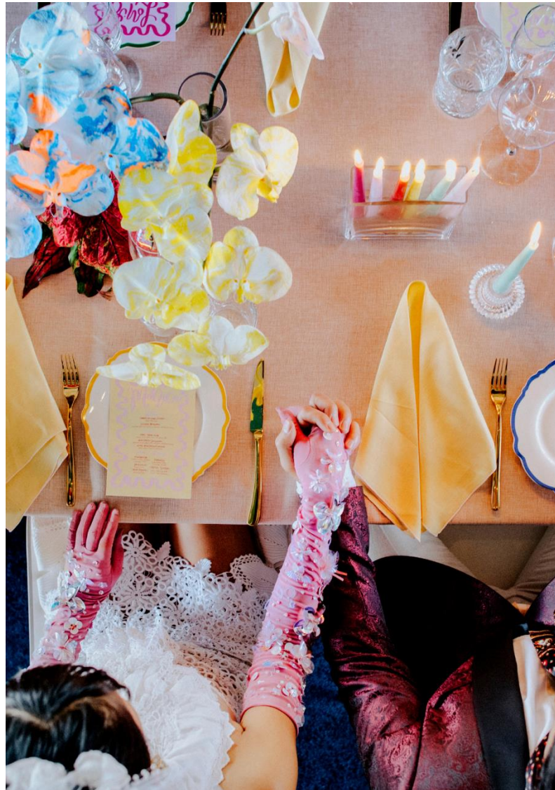
Table settings immaculately curated sets the scene for the creative menus and fine wines QT is famous for.